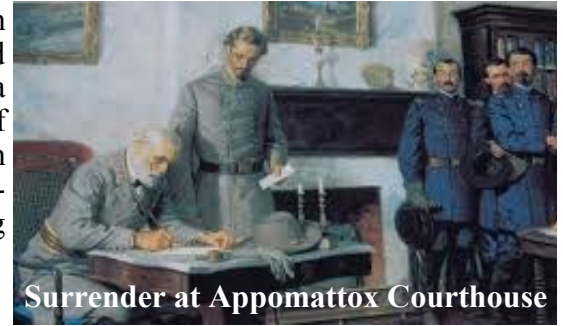
Surrender at Appomattox Courthouse

On April 21st in 1861, the Civil War started right here in South Carolina with the bombardment of Fort Sumter in Charleston Harbor. Amid much celebration, the success of forcing the Union Force to surrender led to articles of secession in the southern states and the formation of the Confederate States of America [CSA].