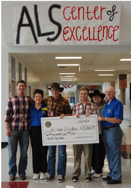
Greenville Representatives with Oversize ALS Donation

Greenville Civitan Club Donates to GHS' ALS Center: Amyotrophic Lateral Sclerosis (ALS), often referred to as "Lou Gehrig's Disease," is a progressive neurodegenerative disease that affects nerve cells in the brain and the spinal cord. The progressive degeneration of the motor neurons in ALS eventually leads to their death. When the motor neurons die, the ability of the brain to initiate and control muscle movement is lost. With voluntary muscle action progressively affected, patients in the later stages of the disease may become totally paralyzed. As motor neurons degenerate, they can no longer send impulses to the muscle fibers that normally result in movement. When muscles no longer receive the messages they begin to atrophy. The disease progresses rapidly causing individuals, to eventually lose all ability to move, eat or speak. Without respiratory support, the individual will die.