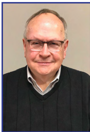
SC District Governor