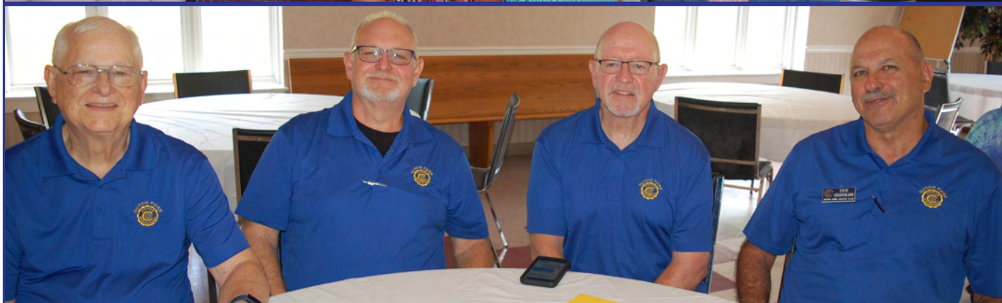
The Gentlemen of Dutch Fork